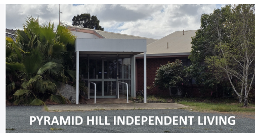
PYRAMID HILL INDEPENDENT LIVING

Help us bring Pyramid Hill Independent Living to life!