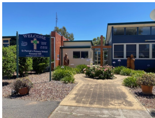
Photographs from St Pats Facebook Page.

As this is our last message in the Pyramid Press, we would like to extend our thanks to our contractors, suppliers and the wider Pyramid Hill community for all their support and wish everyone a very safe and happy Christmas.