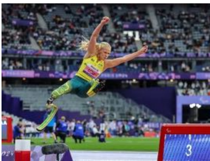
Vanessa Low flies towards gold medal success in the women's long jump with a world record leap.