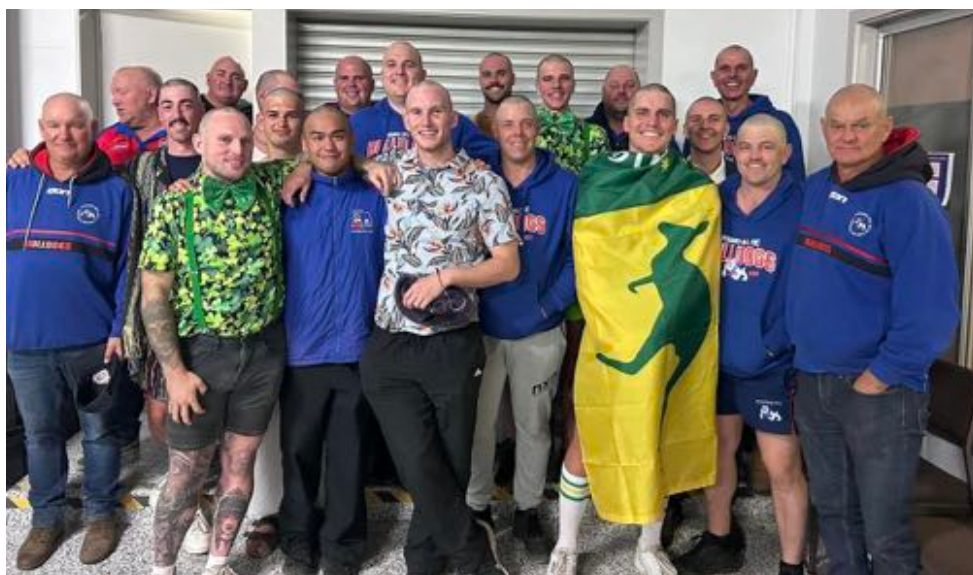
Photo above: Pyramid Hill Football Netball Club raised an enormous amount of money for Peter McCallum by using their heads! More photos and full story in the Sports section of the Press

Sat Mass | 6:30 PM St Patrick's Catholic Church Victoria St Pyramid Hill