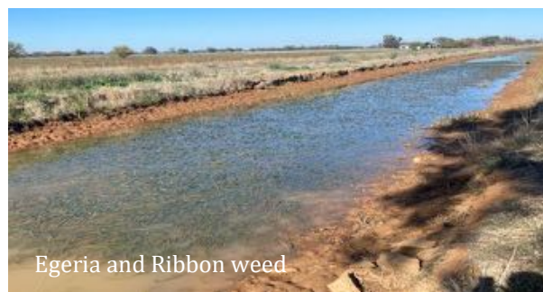
Egeria and Ribbon weed

For more information about the treatment program please visit your local Customer Service Centre or phone us on 1800 013 357.