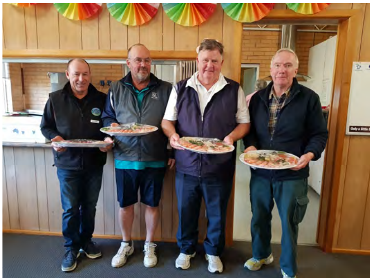
Gunbower-winners of the Seafood Tournament.

Keep Smiling: Two shrimps were at the bar each enjoying a bowl of hot chips. Being a cold day and feeling a tad peckish I thought I'd be bold enough to ask them to share. "Don't even think about it," advised the bartender, "They won't share. They're just two shellfish." And on that note, I bid you all, "Adieu."