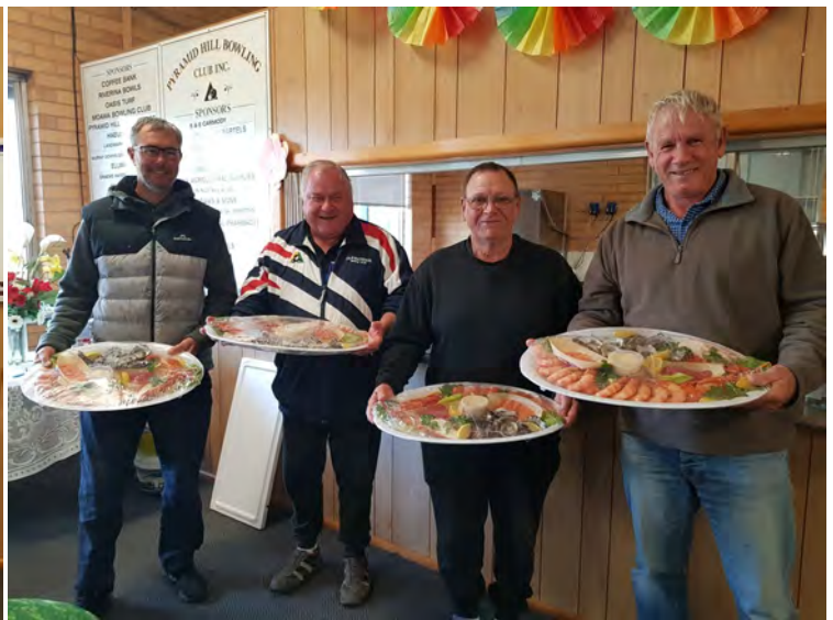
Cohuna Golf - Runners-up of the Seafood Tournament. Seafood trays donated by PH Victoria Hotel.