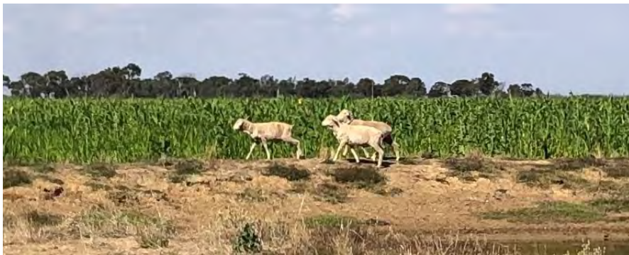
The lambs are in and foraging