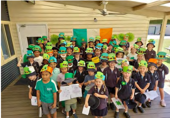
St. Patrick's Day