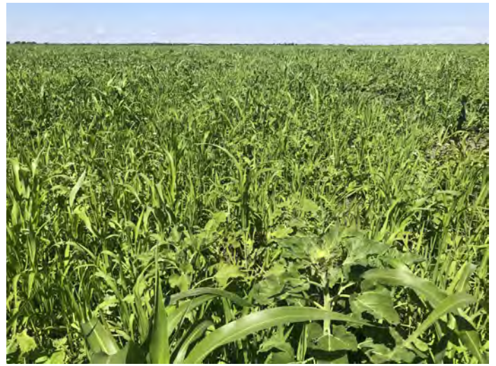
The multi-species crop at 4 weeks old