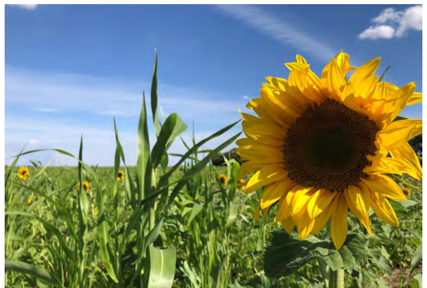
Flowers are blooming in just 7 weeks.