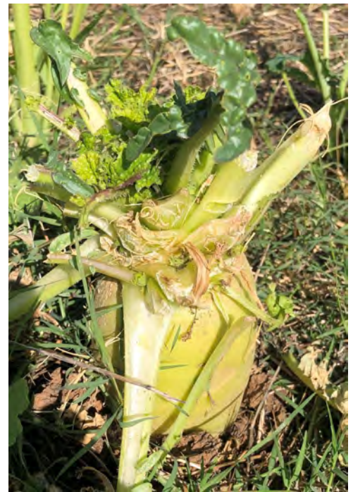
Lambs are eating the radish tops first