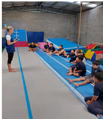
Gymnastics in Cohuna