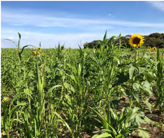
The multi-species crop is now 7 weeks